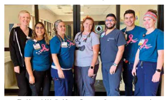
The Memorial Medical Center Emergency Department was voted Best Emergency Department in Mesilla Valley by the local community.