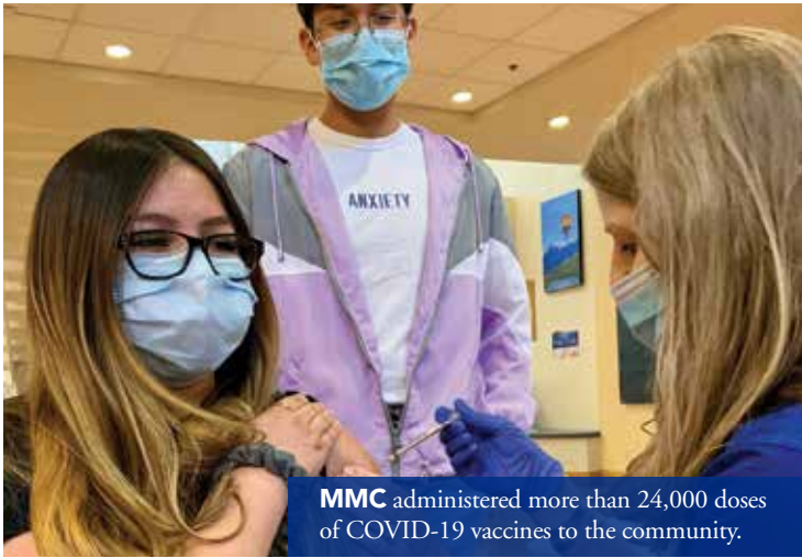
MMC administered more than 24,000 doses of COVID-19 vaccines to the community.