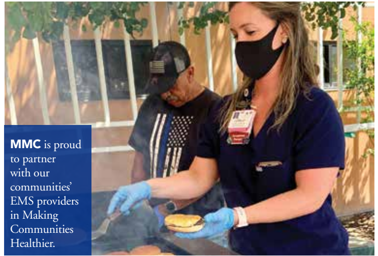
MMC is proud to partner with our communities' EMS providers in Making Communities Healthier.