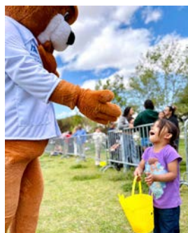
To the delight of families and children across our community, MMC's new mascot, "Memorial Marty," made his debut at many community events and fundraisers in 2025.