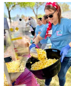
Proudly celebrating 75 years of service to our community, Memorial turned back the clock with a 1950s-themed Hospital Week bash.