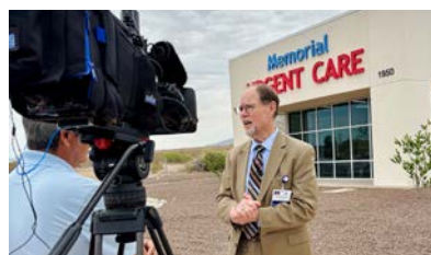
More medical care is now available close to home for residents in Southern Doña Ana County, as we officially opened our new Anthony Urgent Care.